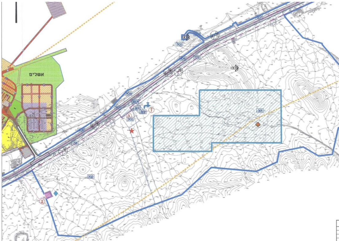
Figure 2: National Outline Plan 10/B/1 (land section 303) with the Site area

The terms and conditions regarding the Concessionaire entitlement for payments due to the electric energy supplied by it to the Grid (the " Concessionaire Revenue ") shall be set out in the Tender Process Documents.